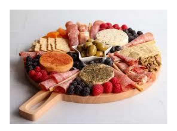
Wednesday November 13<sup>th</sup> 6-8pm

Learn how to put together a charcuterie board before the holidays & take home your creation.